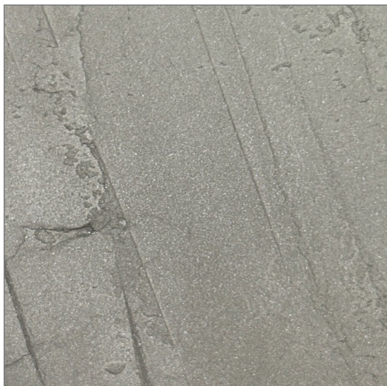
Figure 3: Mass ratio smear test

Performing the same smear test revealed a homogenous mixture. The sample in Figure 3 is lighter gray in color due to the larger amount of silica present. The presence of the white silica is much higher than the 50-50 by volume case. However, the silica is still evenly and thoroughly dispersed throughout the mixture.