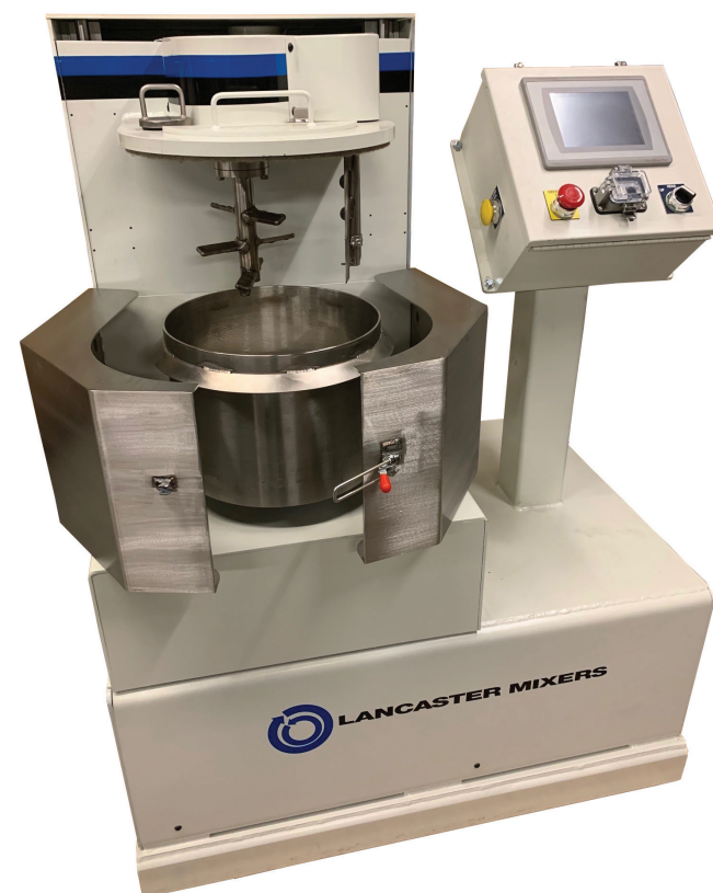
Figure 1: Lancaster K-1 mixer

In the case of a 50-50 volume ratio, the mixture contained a high mass bias of silicon carbide. For each recorded den-