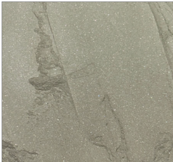
Figure 2: Volume ratio smear test

In Figure 2, the white silica is thoroughly dispersed throughout the silicon carbide.